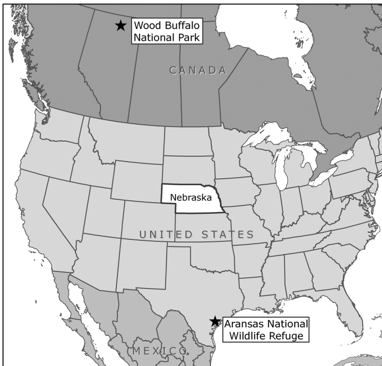
Figure 1. Locations of Whooping Crane breeding habitat in Wood Buffalo National Park and wintering habitat in Aransas National Wildlife Refuge.

science data in a random forests model (Breiman 2001) to identify the relative importance of environmental factors and find areas predicted to be suitable for stopover during migration. Second, we compared our model results with maps depicting wind resource potential. We looked for areas with both adequate wind potential and low suitability for Whooping Crane stopover sites, illustrating an approach to minimize potential conflicts between new wind energy projects and the Whooping Crane. Although general nation-wide guidelines for selecting sites have been suggested to reduce negative effects of wind farms on wildlife (e.g., Kiesecker et al. 2011; USFWS 2012), we refined the focus to demonstrate an approach that could be incorporated into local, species-specific decisions. This work is particularly timely in light of the incidental take permit being considered for wind energy development within the entire Whooping Crane migratory corridor (USFWS 2011).