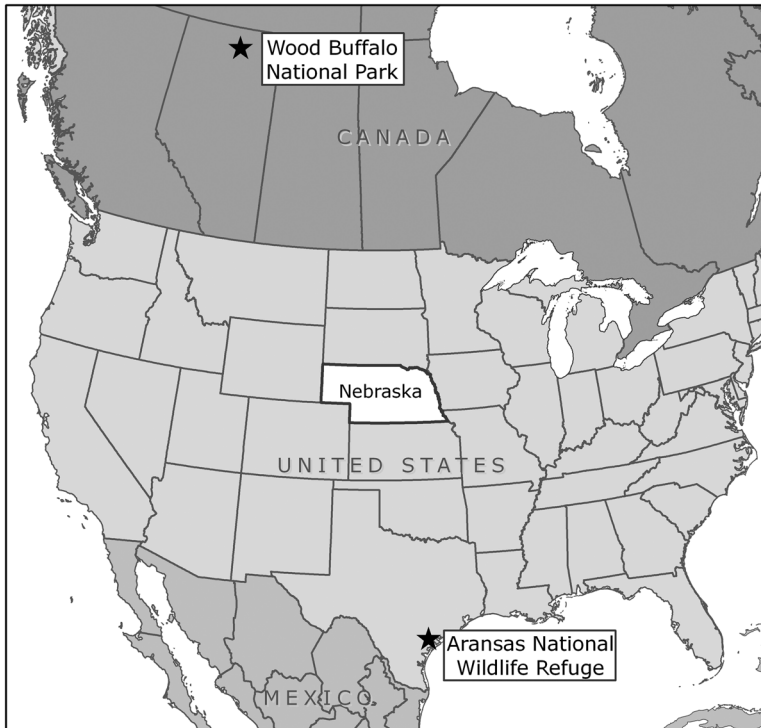
Figure 1. Locations of Whooping Crane breeding habitat in Wood Buffalo National Park and wintering habitat in Aransas National Wildlife Refuge.

science data in a random forests model (Breiman 2001) to identify the relative importance of environmental factors and find areas predicted to be suitable for stopover during migration. Second, we compared our model results with maps depicting wind resource potential. We looked for areas with both adequate wind potential and low suitability for Whooping Crane stopover sites, illustrating an approach to minimize potential conflicts between new wind energy projects and the Whooping Crane. Although general nation-wide guidelines for selecting sites have been suggested to reduce negative effects of wind farms on wildlife (e.g., Kiesecker et al. 2011; USFWS 2012), we refined the focus to demonstrate an approach that could be incorporated into local, species-specific decisions. This work is particularly timely in light of the incidental take permit being considered for wind energy development within the entire Whooping Crane migratory corridor (USFWS 2011).